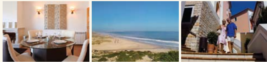
Blending seamlessly into their breathtaking surroundings, each of the homes at Praia D'El Rey offers something different.

It's not surprising that property values here are rising. Surrounded by the stunning scenery, history, and charming villages of the Silver Coast, Praia D'El Rey has become a major destination for second home buyers and investors alike.