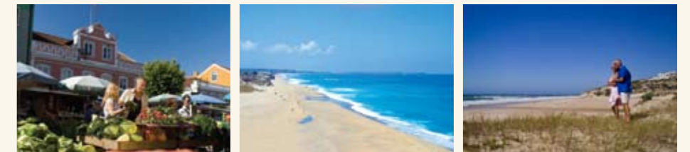
Praia D'El Rey's unique location makes it a very special place and every day spent in this area is one of discovery. Once you've visited, it is a place you'll never want to leave.

Few resorts are more perfectly situated than Praia D'El Rey. Still within easy reach of the capital Lisbon, this 230 hectare estate overlooks the wide Atlantic ocean and has magnificent views, making it one of the most desirable locations in Portugal.